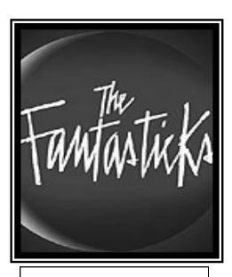
Performances April Shen HS East April 2010